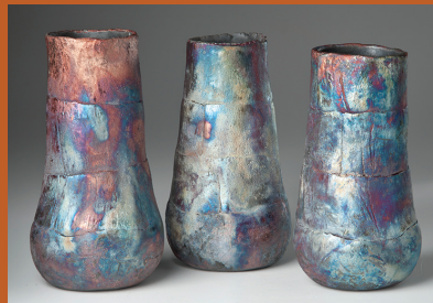
2. DUKE POTTERY