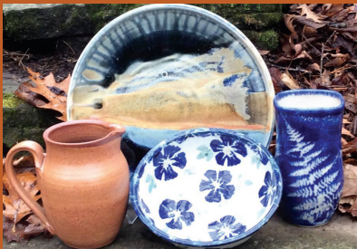
1. CLARYVILLE POTTERY

Talk to our talented potters about how they harness earth, air, water, and fire to create all things whimsical, serious, lighthearted and beautiful. Shop in their galleries. Or take a class and throw a vessel of your own as a keepsake of your time in our Sullivan Catskills.