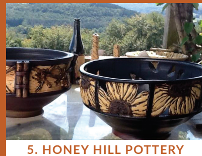
5. HONEY HILL POTTERY