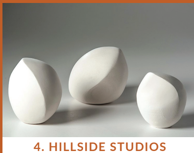
4. HILLSIDE STUDIOS