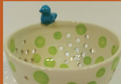
3. EARTHGIRL POTTERY