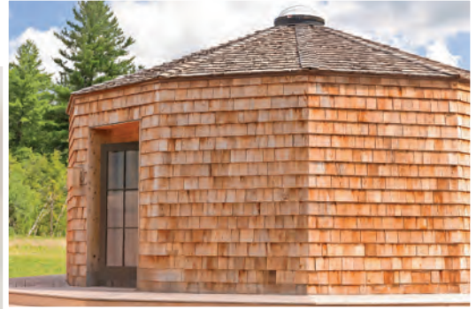
The distinct exterior of the Rounds at Scribner's Catskill Lodge envelopes cozy cabin décor.